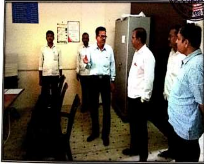
स्पर्धा परीक्षा विभागास शिवाजी विद्यापीठ संलग्नता समितीची भेट

महाविद्यालये "करिअर कॉउन्सलिंग " या विषयावर व्याख्यानाचे आयोजन